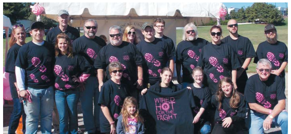
Local 666 members and fellow participants on the IBEW/NECA electrical team gather for Making Strides against breast cancer event.

Our Volunteer Organizing Committee meets