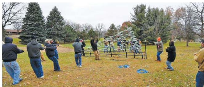
St. Paul, MN, Local 110 volunteers raise a 30-foot tall Christmas tree for IBEW Holiday Lights in the Park display.