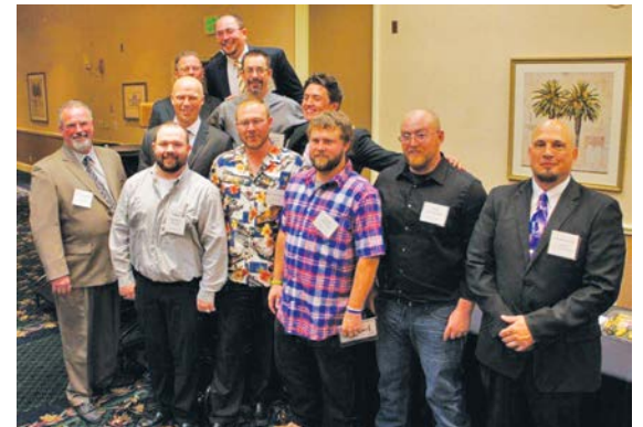
Denver Local 68 congratulates 2013 JATC apprenticeship graduates.