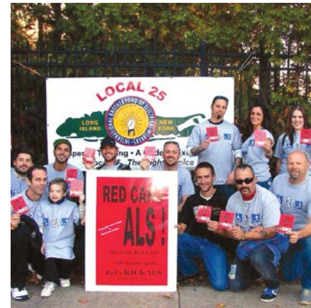
Members of Long Island, N.Y., Local 25 raise money and awareness of amyotrophic lateral sclerosis, or Lou Gehrig’s disease.

Ride For Life has raised more than $7 million for ALS research and patient