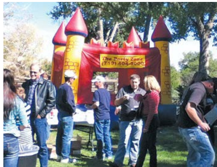
Attendees enjoy Local 12 Annual Picnic.