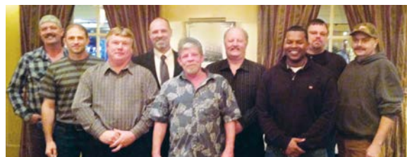
Local 412 congratulates 2013 apprenticeship graduates.