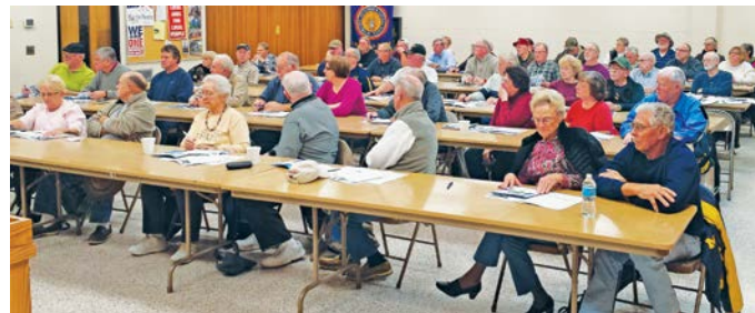
Local 692 holds a retirees meeting on health care.