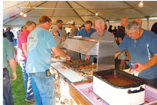
Local 160 members enjoy the 30th Annual Pig Roast.