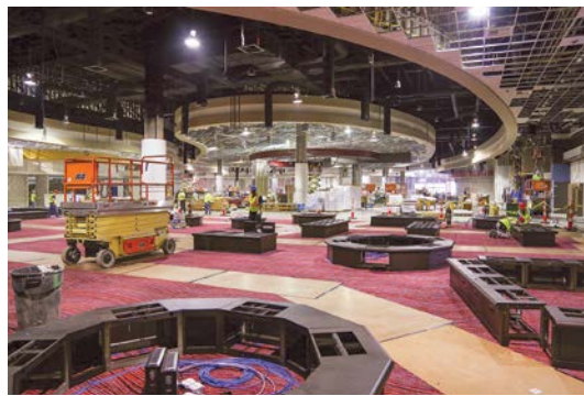
Miami Valley Gaming

He says it took some convincing to get signatory contractors to go after