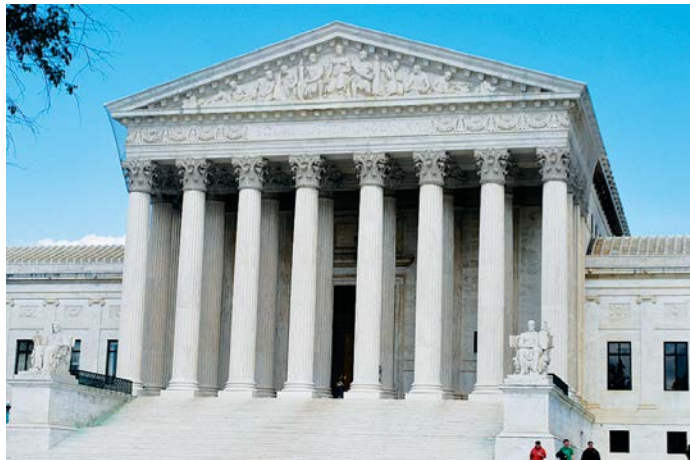
U.S. Supreme Court cases heard in January could set back efforts of unions and others to level the playing field between corporations and workers across the nation.