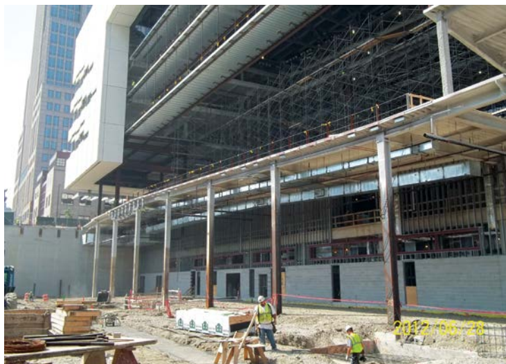
Ohio construction is putting IBEW members back to work, on projects including Cleveland’s new convention center, left, and the Miami Valley’s first-ever combined gaming facility and horse track.

And market share is seeing strong, progressive growth. In 2004, the local had less than 40 percent of the electrical construction market, according to