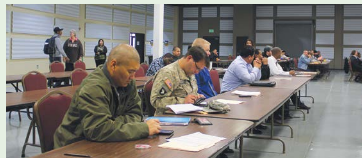
L.A. Local 11 aims to recruit at least 50 percent of future apprentices from among the ranks of military veterans.

A story on the training program posted on the campaign blog of Bob Hertzberg, a former speaker of the California House, reports on a 2012 study conducted by the United Way of Greater Los Angeles showing the unemployment rate among post-9/11 veterans in Los Angeles County rising to 18 percent. "Even worse, 35 percent of this same group of veterans doesn't have employment with sustainable income," he says.