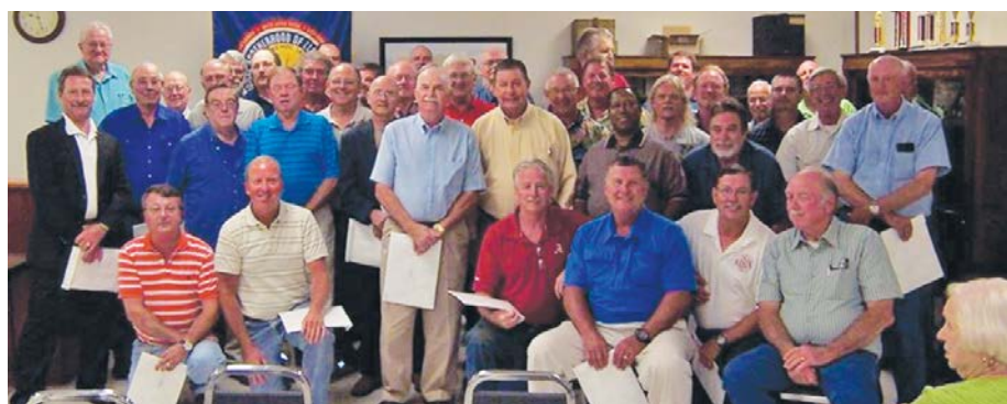
At the Local 558 Service Pins Presentation event of 2013.