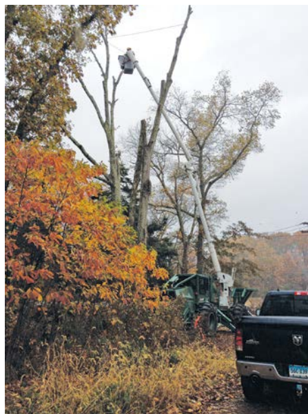
Local 42 "BA" members perform tree clearing along distribution rights-of-way.